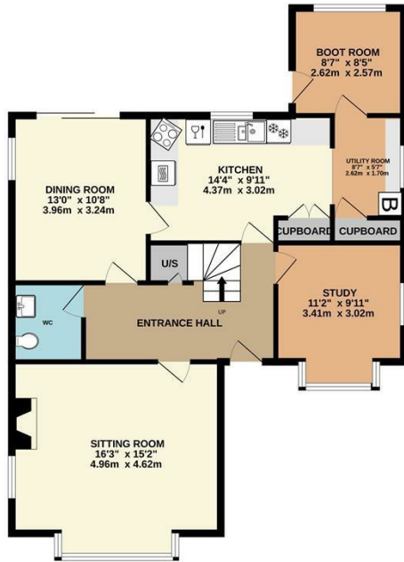
GROUND FLOOR 896 sq.ft. (83.2 sq.m.) approx.